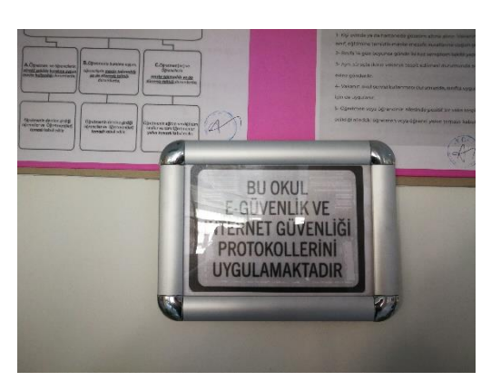
School E-Security Policy Warnings